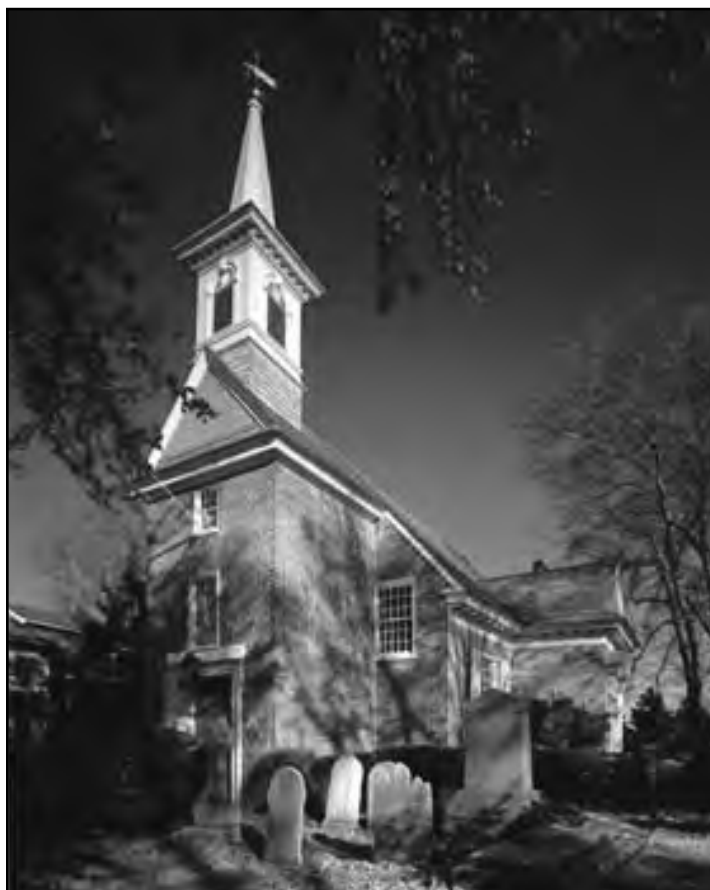
The exterior of Gloria Dei after its 1999 restoration