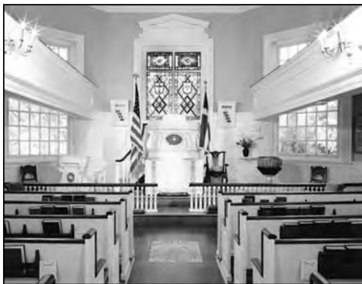
The interior of Gloria Dei Church after its 1999 restoration